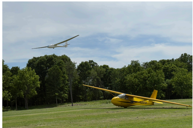
Chuck L (6V) Landing after 2.5 Hrs Flight 5/30