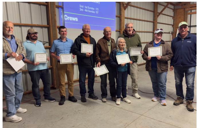
Most Crew Flights - 2nd Sunday (125) 2 - 1st Sunday, 3 - 4th Sunday