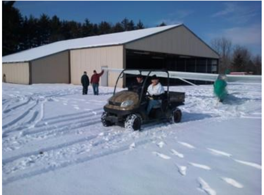
The winning effort!