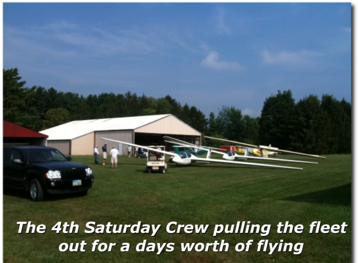
The 4th Saturday Crew pulling the fleet out for a days worth of flying