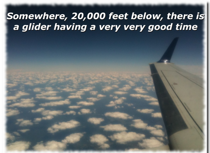
Somewhere, 20,000 feet below, there is a glider having a very very good time