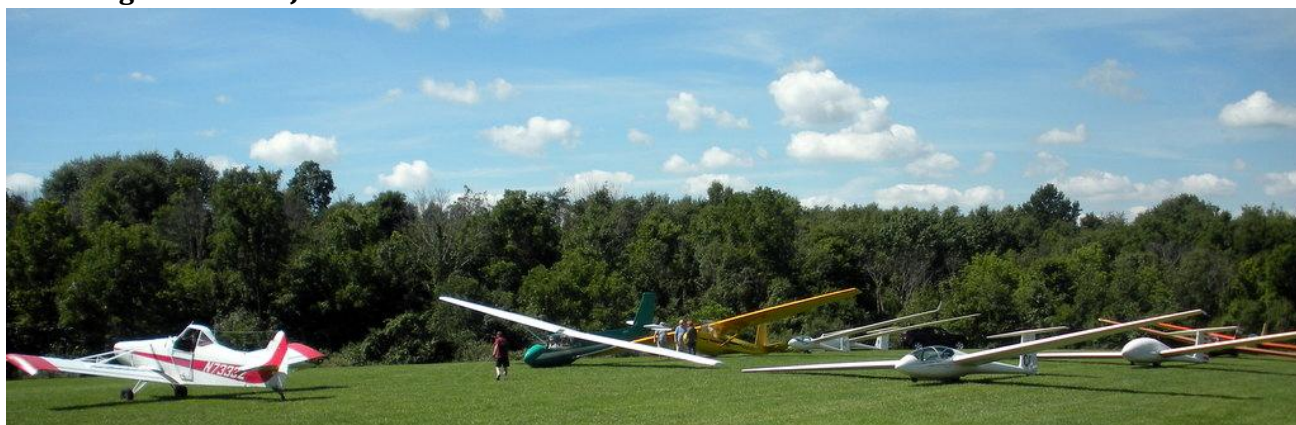
Adult Camp gliders await opportunity to launch on Tuesday at noon.

You may have missed the great soaring weather on Monday and Tuesday, but there is still time to enjoy some soaring the rest of this week. Flights in excess of three hours have been enjoyed each day. Now it is your turn.