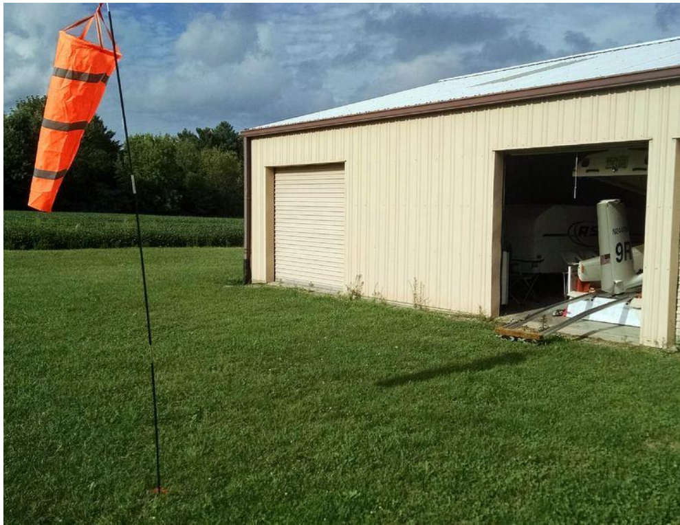
Help needed to assemble 9R.

Since we all occasionally need some help assembling our gliders and we all are reluctant to ask for help, a new system has been devised to get the help needed. As shown in the photo, when you are ready and help is needed, just put your flag (or wind sock) in the ground in front of your hangar. It won't be long before you have more help than needed for the assembly.