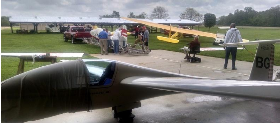
Wednesday crew gets going on the assembly work on two 1-26s and one 1-23.

The Wednesday crew was quite busy. Two 1-26s were assembled. One 1-23 was assembled. A couple of condition inspections were done. The pump house water pump was analyzed to determine why there is no water coming from the hose. No joy on the repair. Henry graded the dirt mounds created when the drainage was installed down the runway. He then mowed the grass that had grown up close to the mounds. Geese were chased away from the pond area. The 2-33 16Q interior was finish installed and the canopy was installed. Then the fuselage was moved out of the shop and into the hangar to make room to begin paint stripping on the wings.