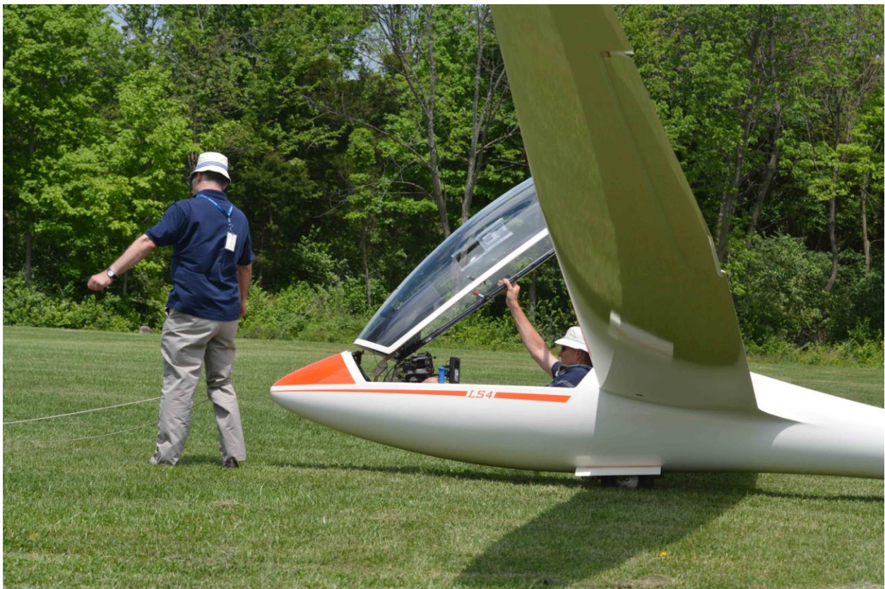
Bernie Fullenkamp ready to close and latch canopy and then ready for hook-up. Photo and editing by Steve Reinke.