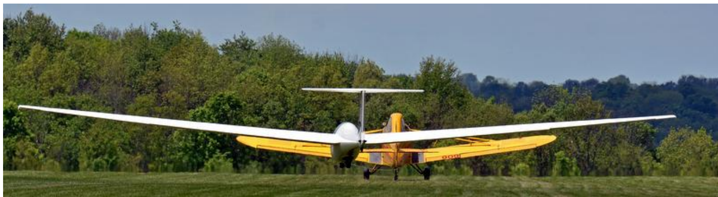
N221CC behind 909 taking off in brisk cross wind on Friday 5/13