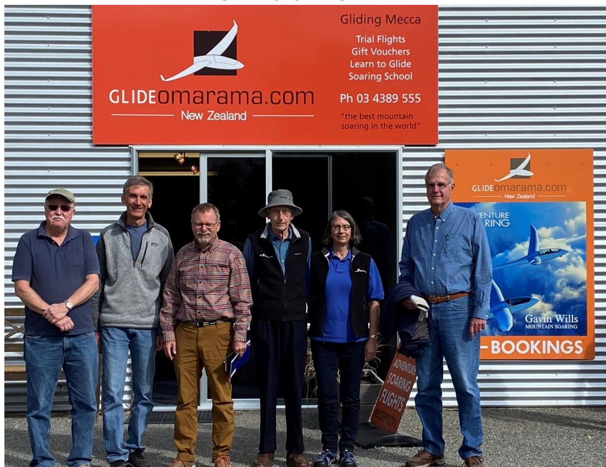
CCSC delegation ready to soar in New Zealand