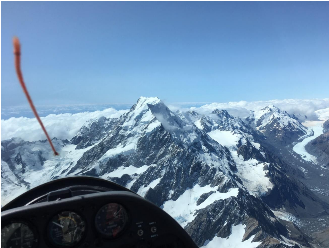
Left and below: Other views in the Mt. Cook area as Bob Miller contemplates that emergency landing area that one should always have in mind.