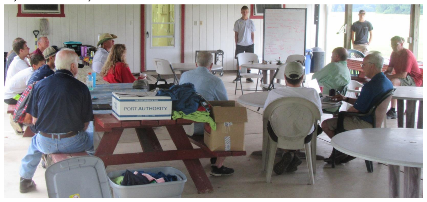
On Monday there was a threat of rain, but it held off long enough for all to fly, but not as much as was desired.

After breakfast in the clubhouse at 7:00 am each day the 8:00 am briefing provides an opportunity to learn about weather and plan accordingly, followed with a focus on safety and on goals and objectives for the day.