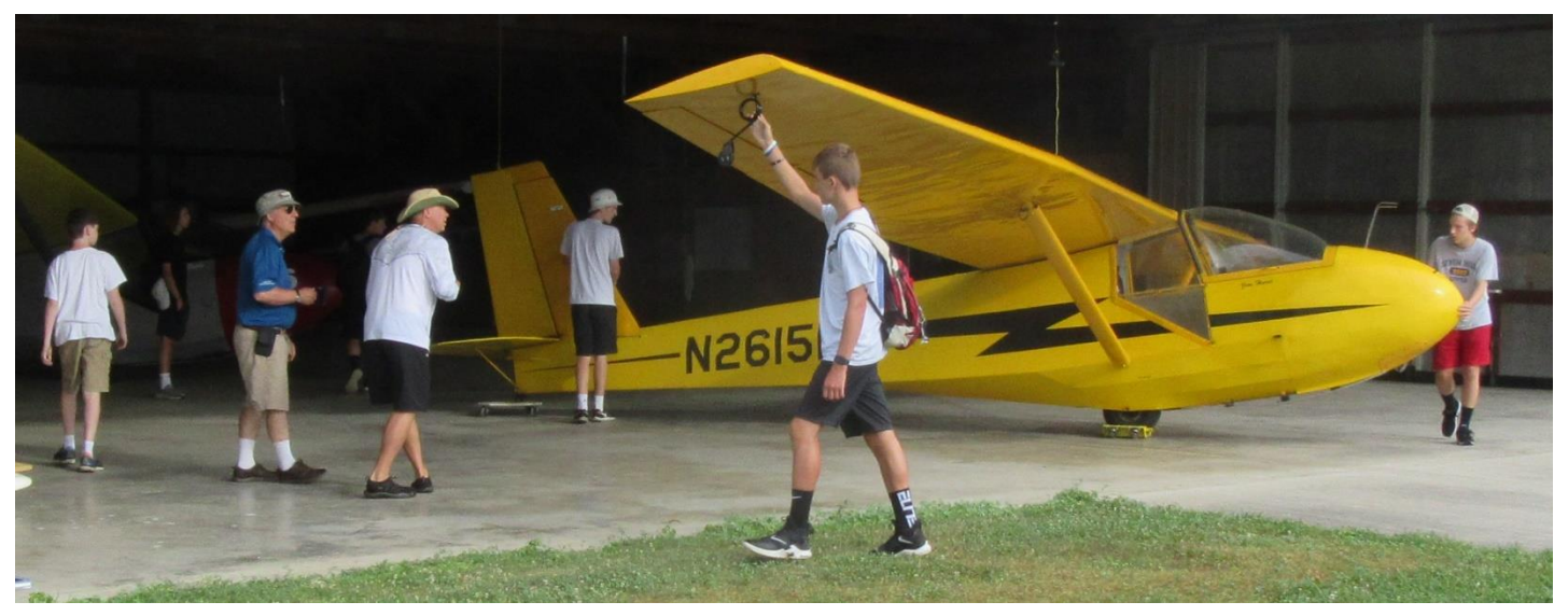
Finally, it was time to fly.