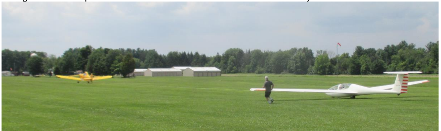
Dick Huskey launching the Grob 103.

The forecast was for a high probability of rain starting at 2 PM. We kept our eyes on the radar and saw some to the north, south and east, but did not see any at the glider club. Meanwhile, we enjoyed 14 flights. The temperature was 88 F but felt like 98 F with the humidity.