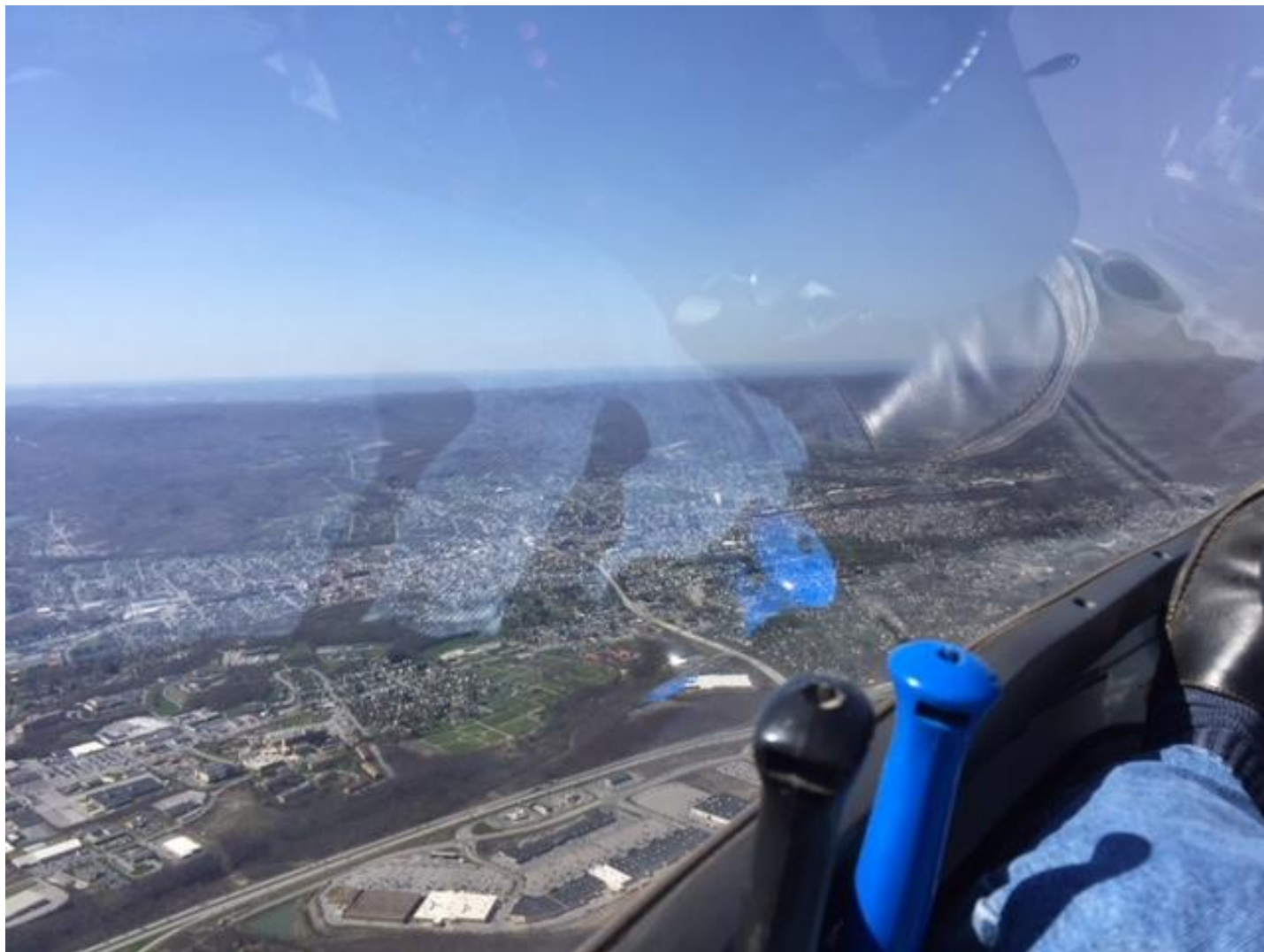
Mark Miller's view when crossing the Altoona gap north bound late in the afternoon of 4/30/2018.