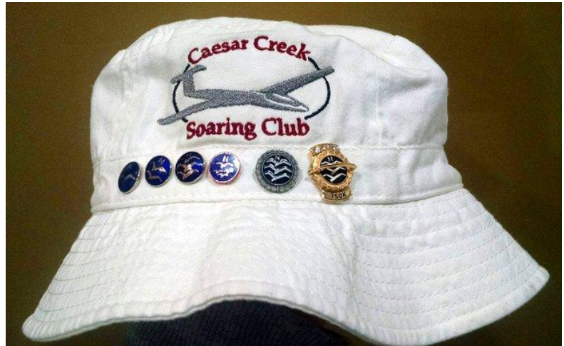
Bucket hat with A, B, C, Bronze, Silver and Gold-750K badges. What is your goal for 2018?

The Bronze Badge was discussed in the prior issue of this newsletter. Fulfilling the requirements for that badge is a good way to start preparing for cross country flying. The next badge is the FAI Silver Badge, but there is an intermediate step that generations of CCSC pilots have found useful. The discussion of the Silver Badge will be delayed until next week and today we will focus on the local triangle that you can use to build your skill and confidence in preparation for the Silver Badge.