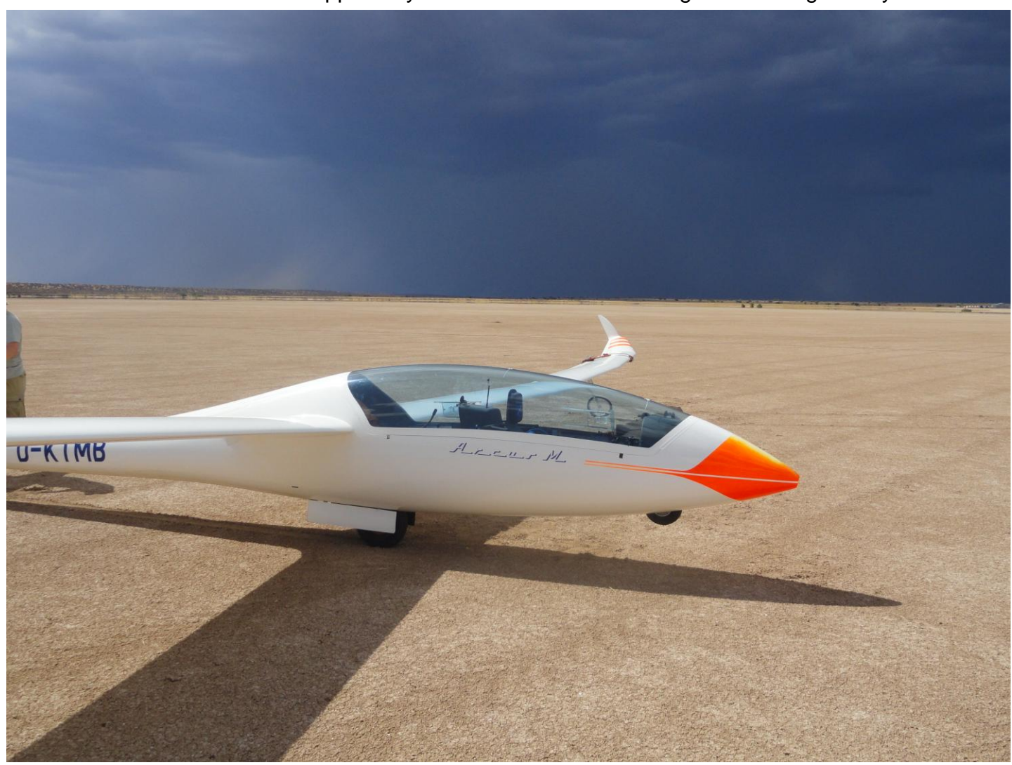
The glider in the picture is the Arcus-M which we flew.

not to flare, but to establish a steady sink rate and to fly the glider onto the ground. After a rain the pan becomes too muddy and one has to use a paved runway. If it rains a lot then the pan becomes a lake and there will be fish in it. Apparently the fish can survive underground during the dry season.