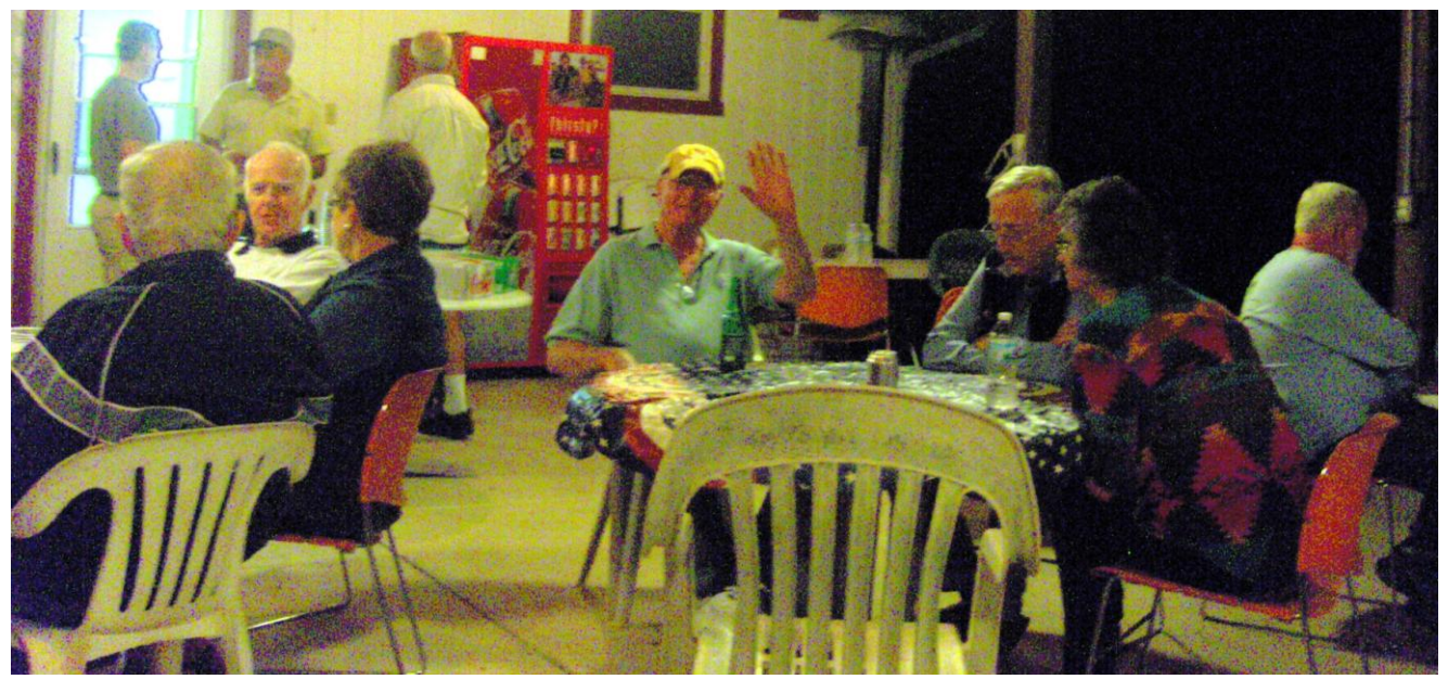
Thanks to Norm Leet for photos and reporting.