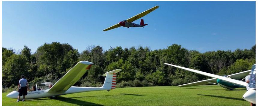
16Q on final.

Due to the on-going starting problems with 909 we used it in the morning for the WPAFB flights, hot refueled and continued towing. If we had shut it down we most likely could not have restarted it, thus the hot refueling and I'll tell you I had flash backs of Viet Nam, Da Nang and Chu Lai; hot refueling F-4s. I was looking for the ordinance guys with the napalm and 500 lb snakeyes. Returned the bird to Cubbys for mag overhaul. Finished the day with 33Z and two refuelings.