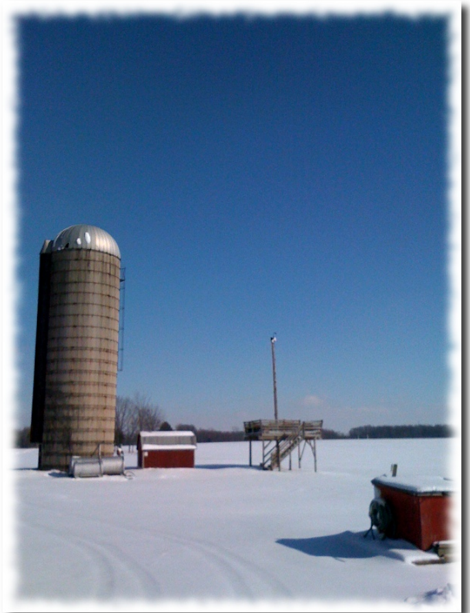
Winter Snows Shows at the Silo