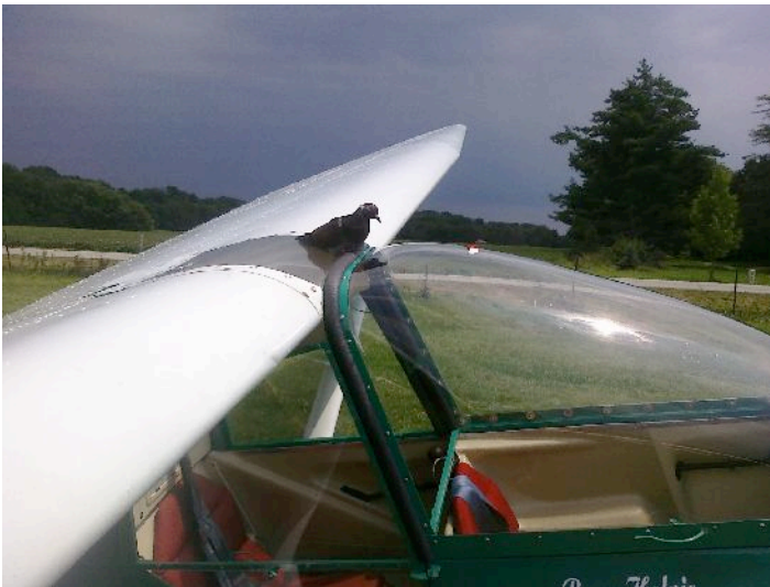
Fellow Flyer Visits 1 st Saturday

I've done this sort of thing with a flight school and found it to be a great way to spark interest and get new student starts. I think it would be worthwhile for our group, and dealing with a glider outdoors would be a heck of a lot easier my previous experience of taking a Cessna 150 apart to get it inside a shopping mall. However, we need plenty of help to make it happen. Are you willing to help?