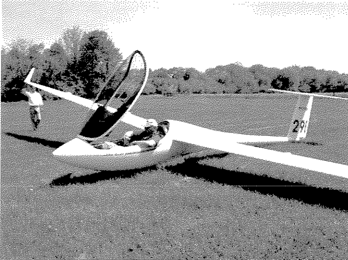
NEW GLIDERS !