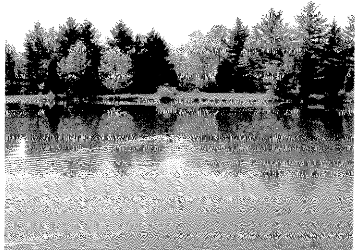
OUR FEATHERED FRIENDS !