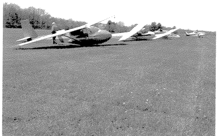
LOTS OF FLYERS!