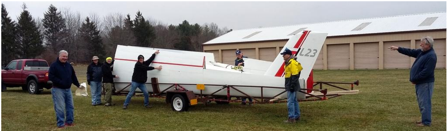
Wednesday Crew securing Blanik to trailer.

With the runway very soggy, the members of the Wednesday Crew busied themselves loading and tying down the Blanik on the open trailer for its trip to Florida and stored it in the pole barn. The buyer is expected to pick it within a week. He plans to use parts to restore his Blanik.