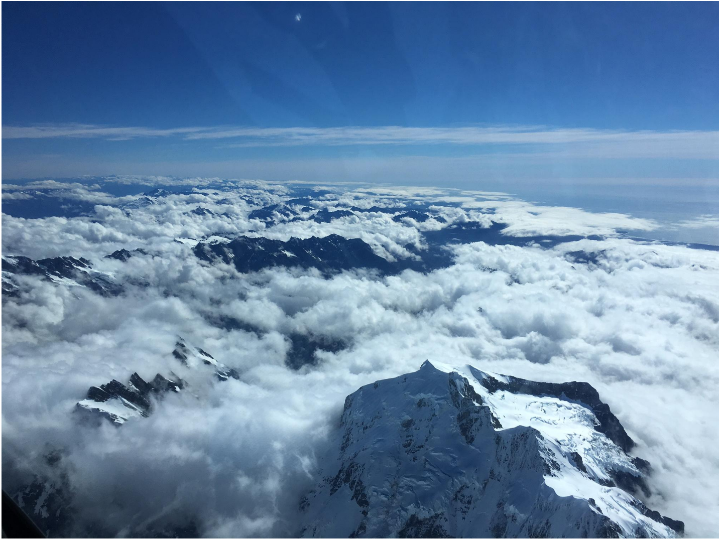
Looking West from Mt. Cook