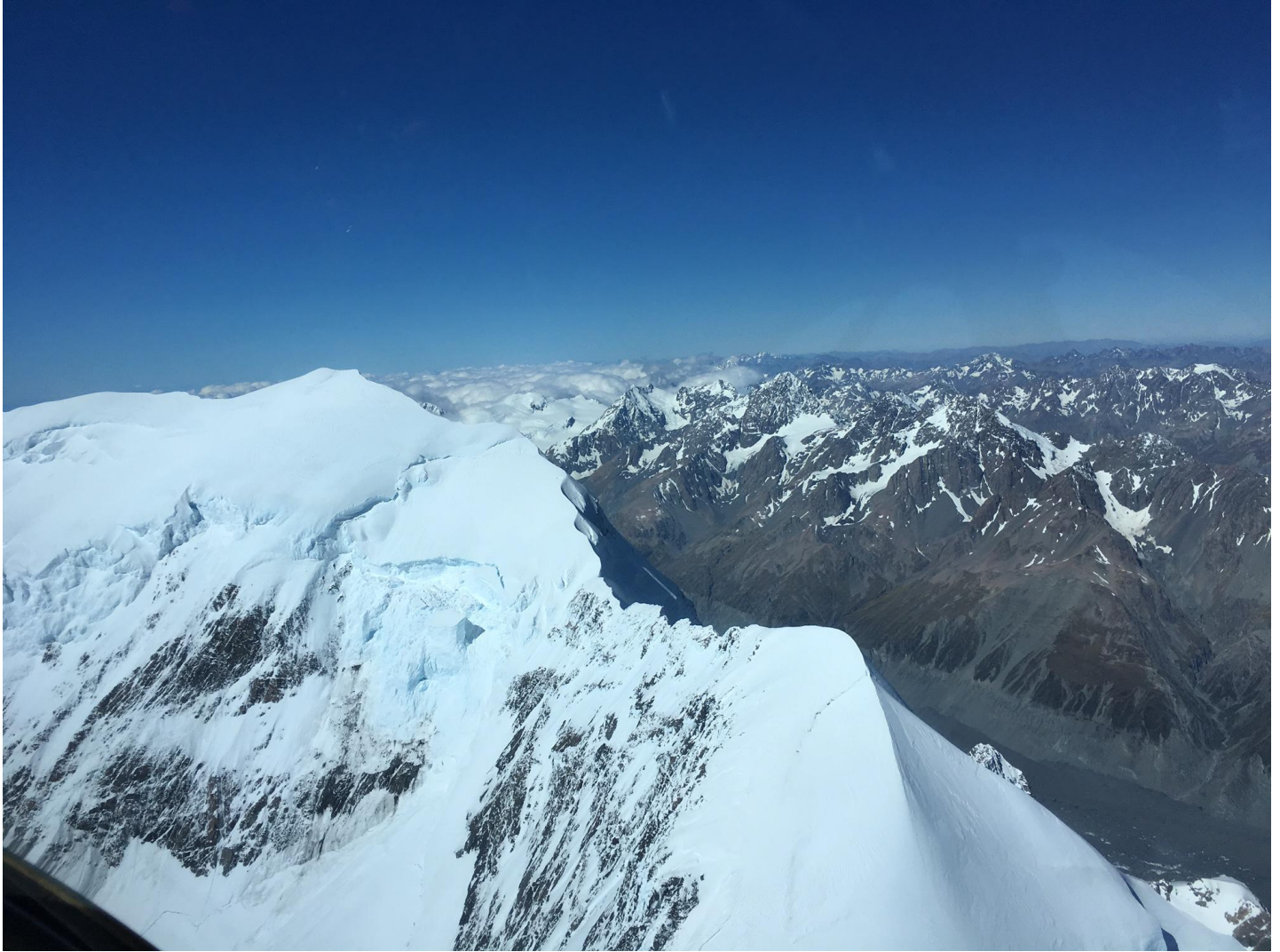
Ridge Soaring Mt. Cook at 1230 feet