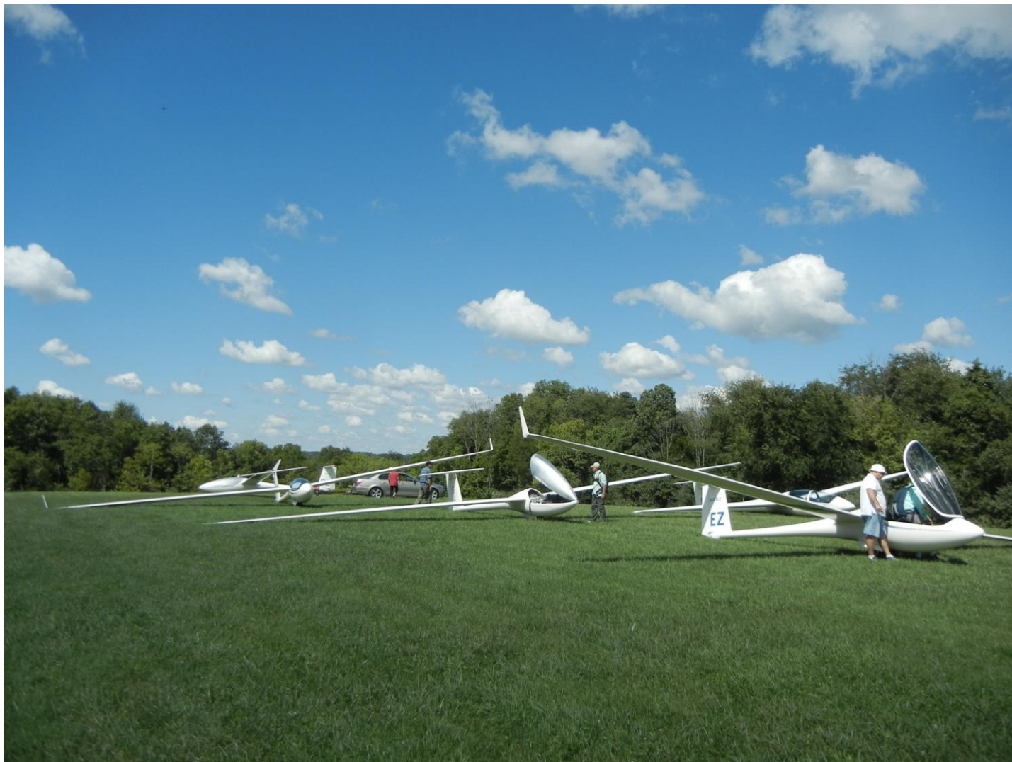
Four of the private ships that launched on Saturday. By 11:30 Saturday morning we had launched our first 3 introductory flights and were preparing to launch the first wave of private ships. Take note of EZ at the front of this queue.