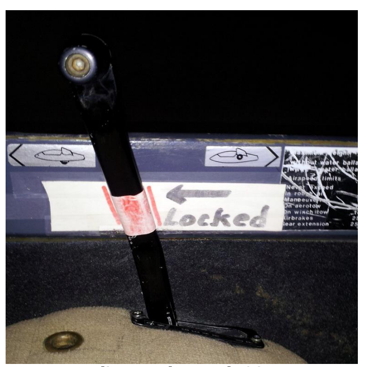
Landing gear down and LOCKED

The photo on the left shows the position of the landing gear handle when the gear is down, but not locked down. In contrast, the photo on the right shows the position of the handle with the landing gear locked down. If you find the handle in the down but not locked position, point this out to your Crew Chief. Then, push the handle forward into the locked position. Thanks for your help.