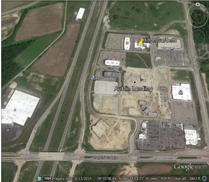
Austin Blvd area Exit #41 — looking North

You're Cordially Invited to: 2015 CCSC Annual Banquet February 21, 2015 18:00 to 22:00 New Location... Same Great Company!