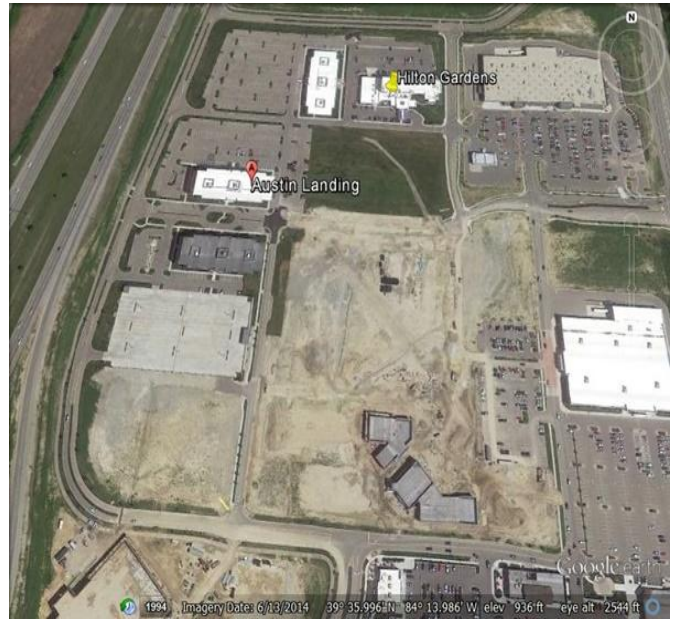
Austin Lndg area