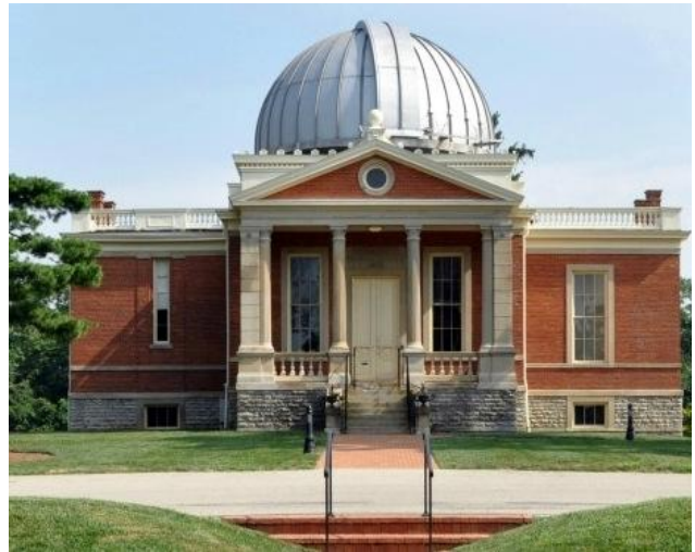
Cincinnati Observatory Center, birthplace of American astronomy and home of the world's oldest telescope still in use.

The cost will be $5 per person. Directions will be provided before the event.