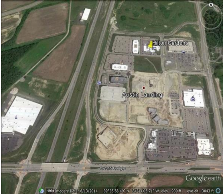
Austin Blvd area Exit #41 — looking North

You're Cordially Invited to: 2015 CCSC Annual Banquet February 21, 2015 18:00 to 22:00 New Location... Same Great Company!