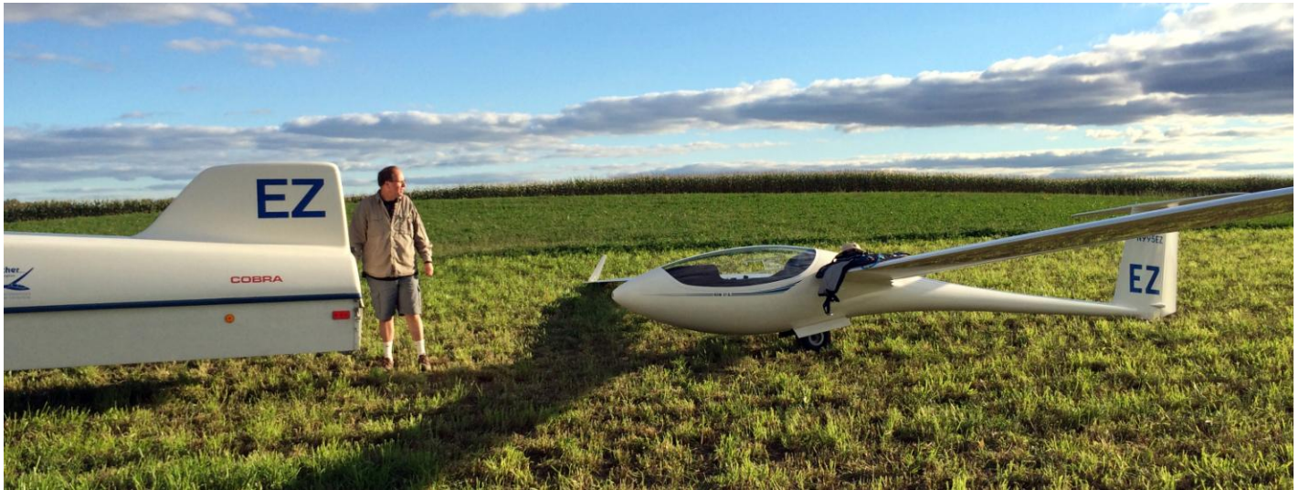
EZ safely nestled in Amish alfalfa field in Indiana after the overdeveloped clouds moved on and the late afternoon sun beamed brightly from the blue sky.