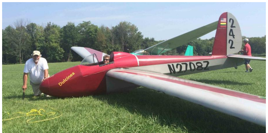
Steve Statkus with Dulcinea

In keeping with tradition, Cub Scout Pack 57 from Lebanon held a camp out at CCSC August 22-24.