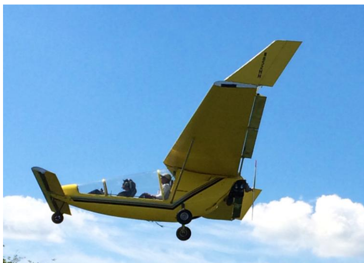
Pete Schradin riding with friend who stopped in for a visit

Please fill out flight your flight cards completely. Several have recently been turned in with missing the aircraft, altitude, date, etc. Noelle tries to avoid overcharging anyone, but you will be charged for the most expensive aircraft if you fail to indicate which one.