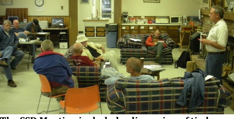
The SSD Meeting included a discussion of tiedowns for private aircraft because several anchors are no longer serviceable.

devoted much of the seminar to explaining how!